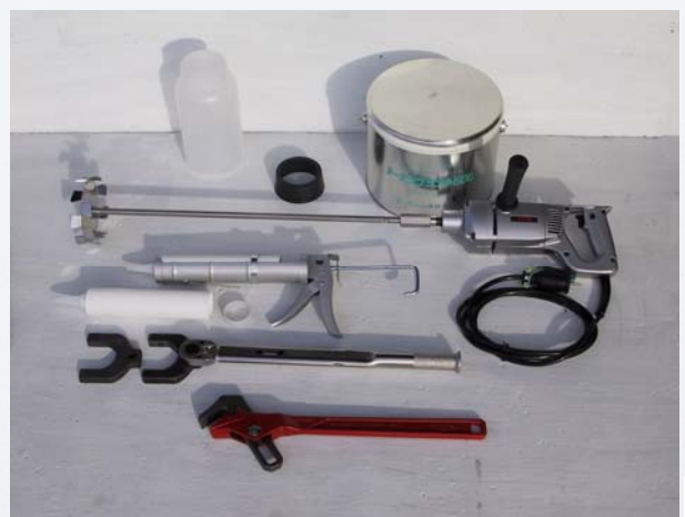
TTK GROUT & CONSTRUCTION TOOLS