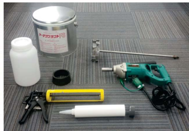
TTK GROUT & CONSTRUCTION TOOLS